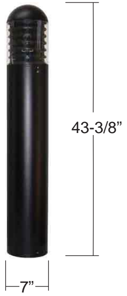
BDL - 100W Metal Halide

The chart is based on bollard with a light center of 3.5'. Each iso-line represents the footcandle level along the path. Each square represents 6'. To change the wattage use the multipliers below.